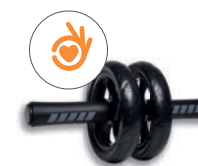
AB WHEEL 25,00 €