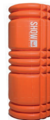
FOAM ROLLER 40,00 €