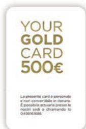
CARD GOLD 500,00 €