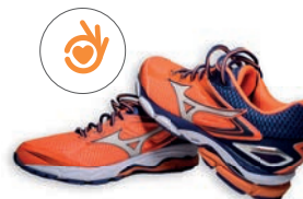
SCARPE RUNNING Da 100,00 €