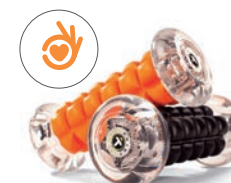
NANO ROLLER 44,00 €