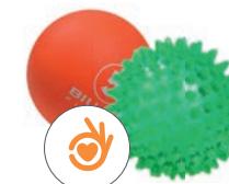
SENSY & TRIGGER BALL Da 10,00 €