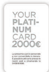
CARD PLATINUM 2000,00 €