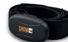
CARDIOFREQUENZIMETRO 50,00 €