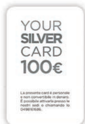
CARD SILVER 100,00 €