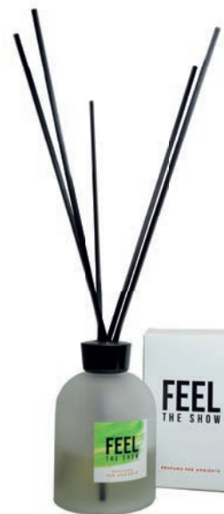
FEEL THE SHOW 25,00 €